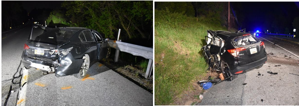
Image 4 and 5: Image 4 is a photograph of the Honda-HRV after being struck head-on by the Infiniti. Image 5 is a photograph of the Infiniti after coming to rest against the guardrail.