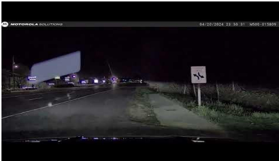
Image 1: Still-image from Deputy Hessler's dash-board camera footage while stopped on Liberty Road, prior to the Infiniti driving past at a high rate of speed. Click image for short video clip.

On April 20, 2024, at approximately 11:30 p.m., Deputy Hessler was driving a marked police cruiser on routine patrol eastbound on Liberty Road in Eldersburg, Maryland. After passing the intersection of Liberty Road and Ridge Road, Deputy Hessler pulled over to the shoulder of Liberty Road and turned off his headlights. A few moments later, a 2018 Black Infiniti Q50 passed the Deputy Hessler traveling at a high rate of speed. The posted speed limit on Liberty Road is 50 m.p.h. At 11:30:30 p.m., as the Infiniti drove by, Deputy Hessler activated the headlights and his emergency lights and sirens and began following the Infiniti eastbound on Liberty Road. The weather conditions were clear and there was minimal traffic on Liberty Road.