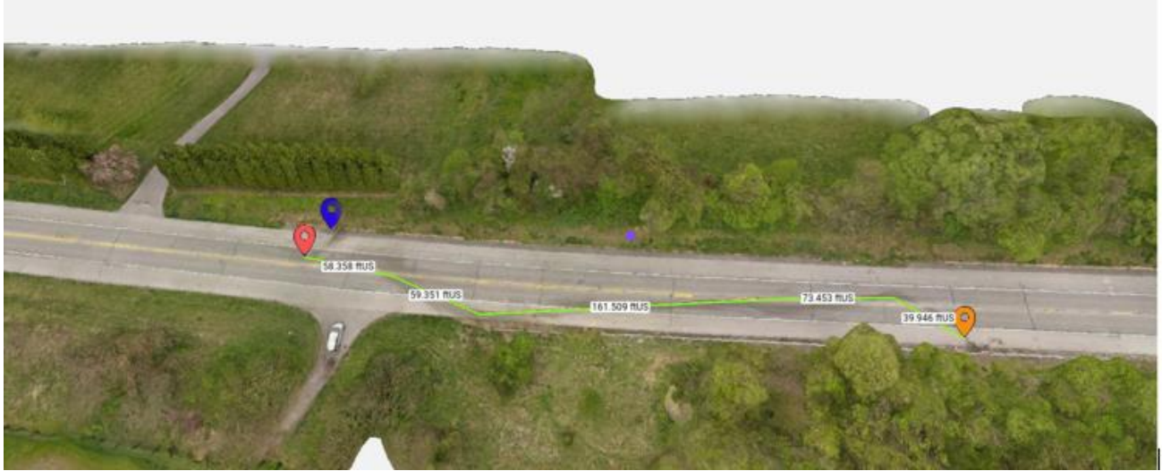
Image 3: A graphic depicting the aftermath of the crash. The red point shows the point of impact, the blue point shows the Honda's final rest position, and the orange point represents the Infiniti's final resting position. The green line shows the Infiniti's path after the initial impact.